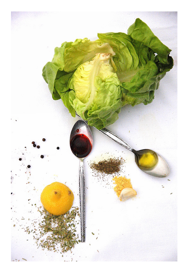
Irving Penn / Salad Ingredients (Related Objects) Joe Ziołkowski PA2 2010.2 Still life Page 2

1. STILL LIFE WITH AT LEAST 4 RELATED OBJECTS: This can be a set of your choice that are related and work in harmony. The background can relate to the objects as well. Think about simple still life setups to start the assignment off and become familiar in the studio.