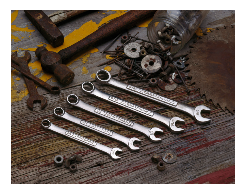
Joe Ziolkowski / Dad's Tools (Reflective Surface)

2. STILL LIFE WITH REFLECTIVE SURFACE: This set will have a shiny object that has to have a white broad card or light reflecting into the surface to make it fully illuminated. Again, you can use more than one object, but you must be sure to highlight the reflective shiny surface and have a related background.