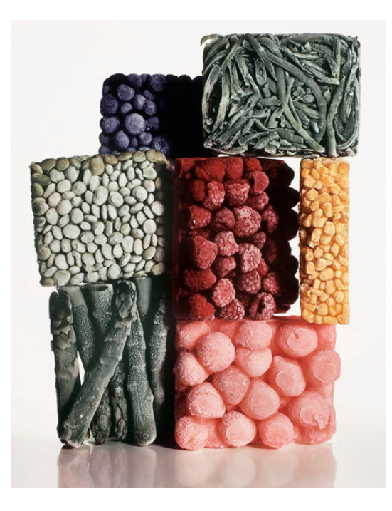
Irving Penn / Frozen Foods with String Beans, NY 1977

Due: 4 Final images. Thursday, February 3, 2011, Crit #8. At least two contact sheets, 20 images per sheet.